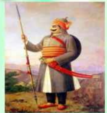
Maharana Pratap Singh

Throughout his life, Maharana Pratap engaged in several battles, fiercely defending Mewar. His qualities of bravery, honesty, and a commitment to protecting his kingdom earned him renown. He set an example of valor in his lifetime, and his legacy continues to be remembered as that of a great warrior in Indian history.